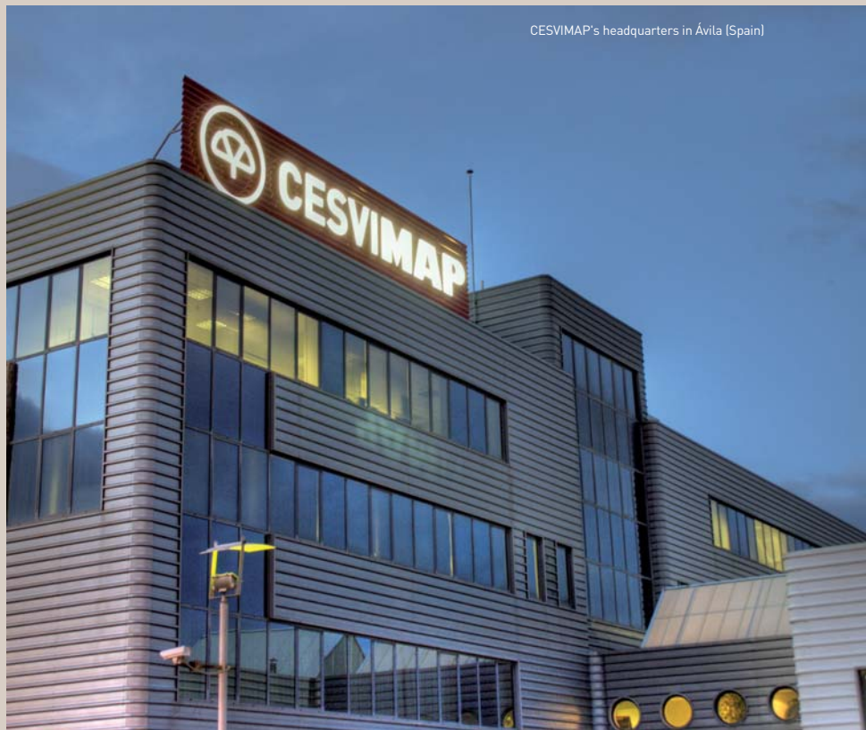
CESVIMAP's headquarters in Ávila (Spain)

By definition, CESVIMAP and the rest of the centres are flexible, adaptable structures capable of responding quickly and reliably to the needs of insurance companies and other related sectors: vehicle manufacturers, repair shops, makers of repair equipment and products. It is therefore very difficult to get a snapshot of its activities. They have to be permanently reinvented.