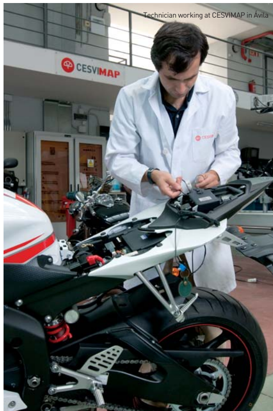
Technician working at CESVIMAP in Ávila

It is almost 40 years now since a number of motor insurance companies began to share their concerns about the trend in the cost of motor claims, especially those involving material damage. From the exchange of their respective experiences, there was one thing on which they agreed: the more they knew about the vehicles, the easier it was to establish true expectations of cost. In short, knowing about the insured risk, the vehicle and its circumstances, its use and the driver, allowed the business to be managed more appropriately.