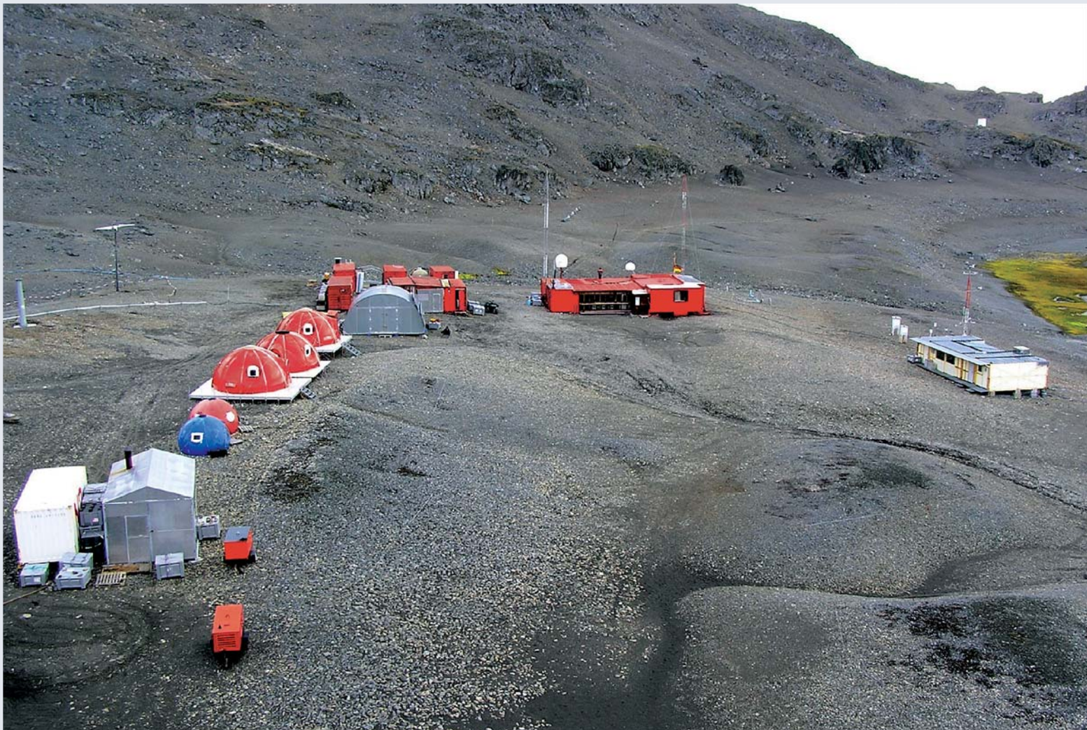
Juan Carlos I Antarctic Base on Livingston island. MICINN

The ship carries out a wide variety of tasks covering the different fields of oceanographic research: hydrography as well as biological, geological and seismological studies, and research into marine physics and biochemistry