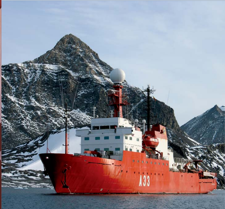
Hespérides vessel in the Antarctic