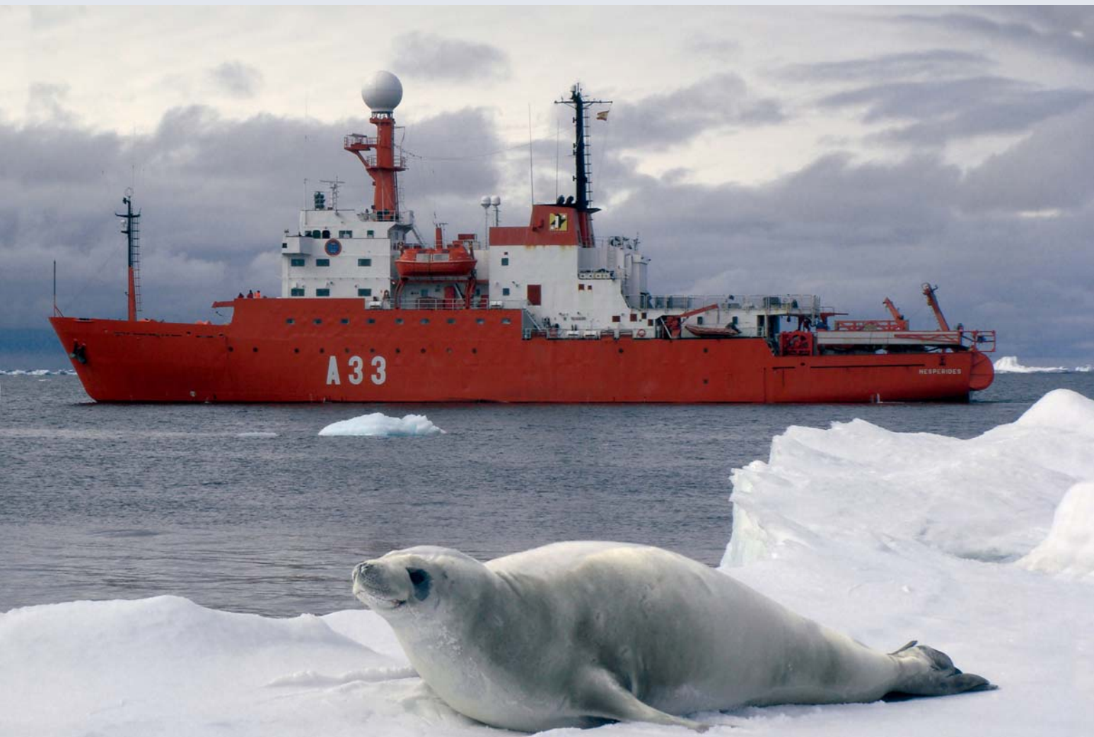
Hespérides vessel in the Antarctic

ment on board include two multibeam echosounders, one for deep water down to 11,000 meters (EM-120) and the other for shallow water down to 600 meters; two monobeam echosounders, the EK-60 to quantify biomass and the EA-600 for bathymetric/hydrographic work, one TOPAS seismic profiler with sediment penetration capability of up to 250 meters, one Acoustic Doppler Current Profiler (ADCP) and two seismic shooters.