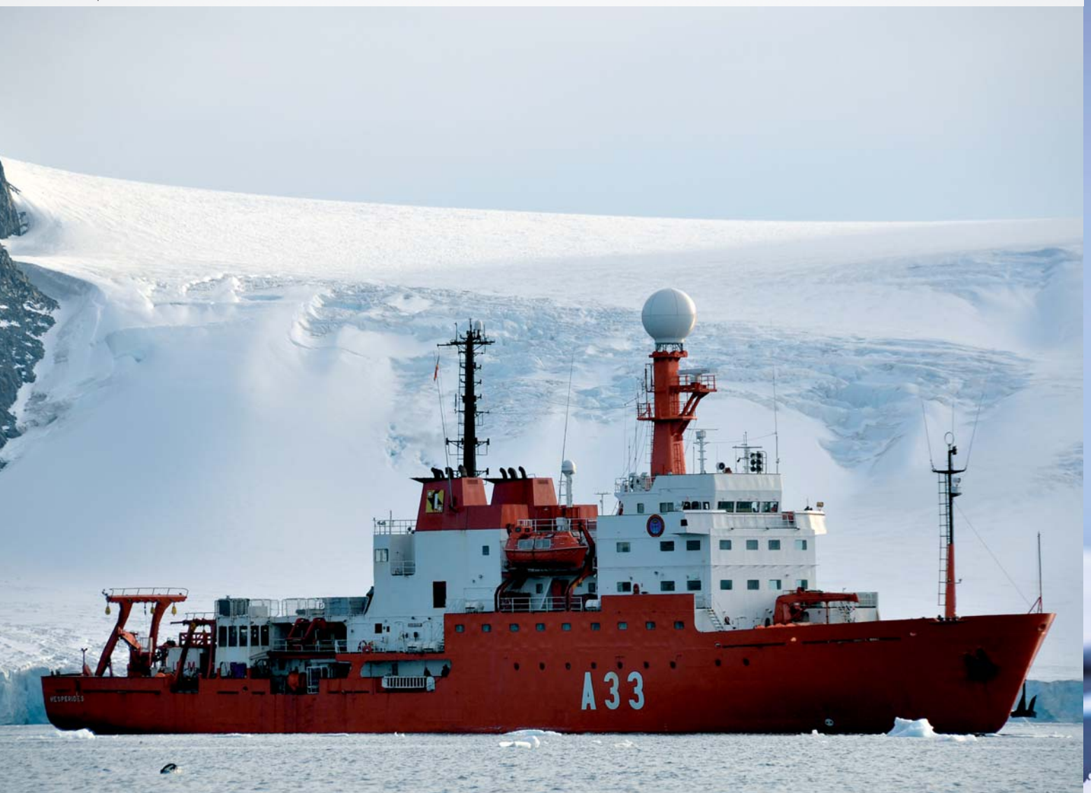
Hespérides vessel on the Antarctic

In Spain alone, there are 18 other vessels that carry out oceanographic work. Some of them belong to the Spanish Oceanographic Institute, and others are operated by the CSIC, SEGEPESCA (General Secretariat for Marine Fisheries) and also the Naval Hydrographic Institute. However, it is true that the