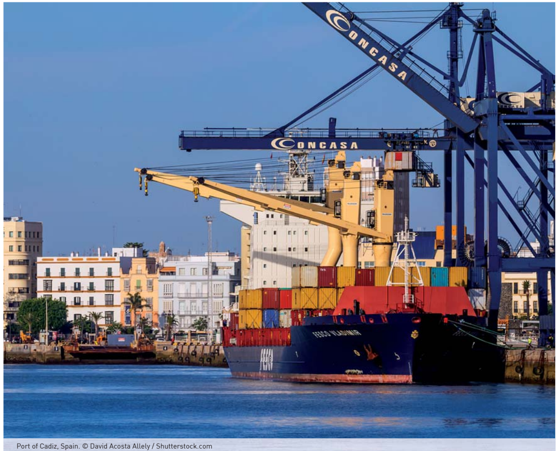
Port of Cadiz, Spain.

The fact that exports represent 35% of our GDP is an achievement of the Spanish professionals who have travelled the world over to market our products. Spain has taught the rest of the world a lesson on exporting success