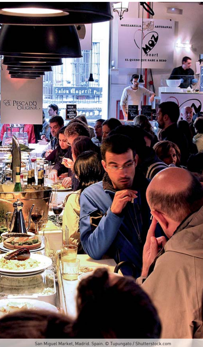
San Miguel Market, Madrid, Spain.

and econometrics are making a mistake by looking exclusively at bank lending because it is non-bank lending that is growing. That is why I talk about bonds and direct financing, which already amount to EUR 85 billion (8.5% of GDP). International banks are supporting Spanish companies, bank lending is stabilising and non-bank financing is starting to shoot up, all of which leads to the conclusion that 2014 will be the first year in which finance will enable GDP growth. However, finance is different from what it used to be. Companies are issuing bonds and an Alternative Fixed-Income Market has been set up to help them do that. Nonetheless, there is still a question mark over small businesses. The solution is to provide SME loans to open up securitisation markets, but it must be implemented at the