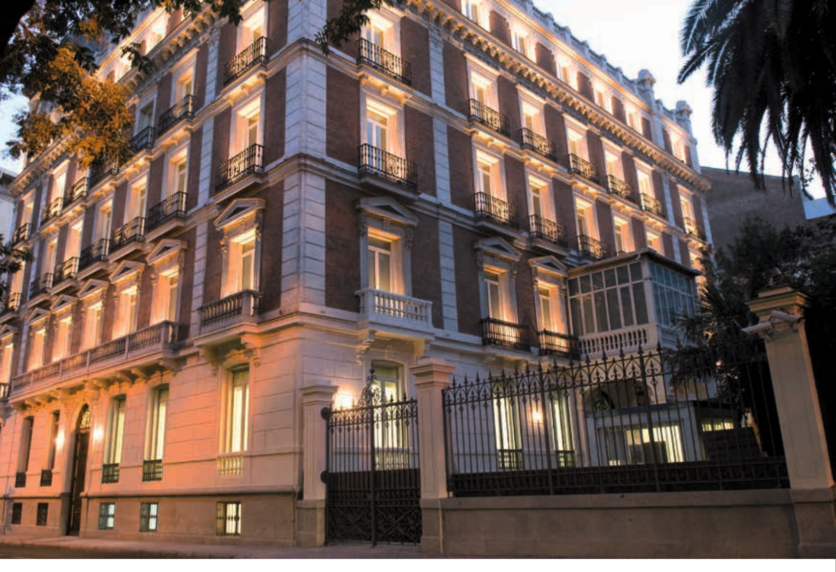
Fundación MAPFRE Madrid.