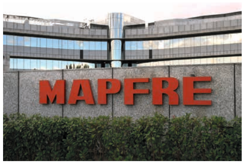
MAPFRE headquarters in Madrid.