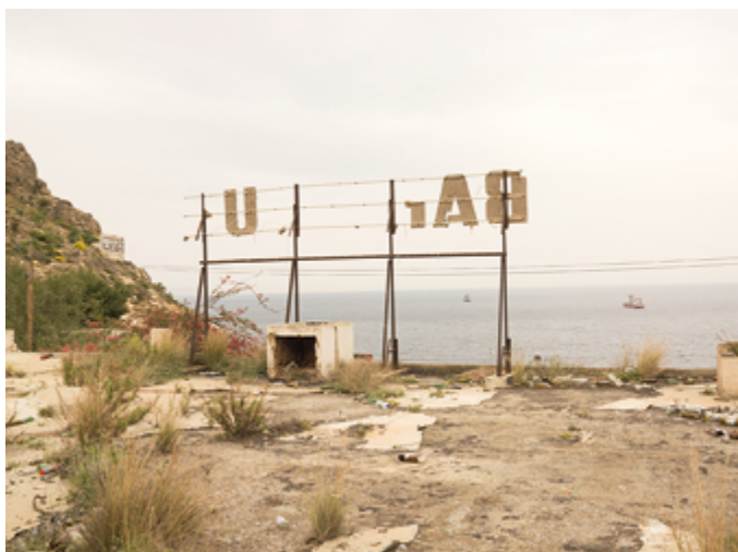
Castell del Rey, Almería, 2007. Museo Centro de Arte Dos de Mayo Collection

Fundación MAPFRE presents the first major solo exhibition dedicated to José Guerrero, an artist from Granada who has spent the last twenty years exploring how the natural, architectural and archaeological landscape is related to human activity and the passage of time. In his body of work, José Guerrero (Granada, 1979) envisions the landscape as an active, dynamic entity where the sociopolitical, the cultural and the social imaginary intertwine in intriguing ways. The stratification of time and memory and the visible signs of the intersection and overlap of different cultures are recurring themes in this artist's oeuvre.