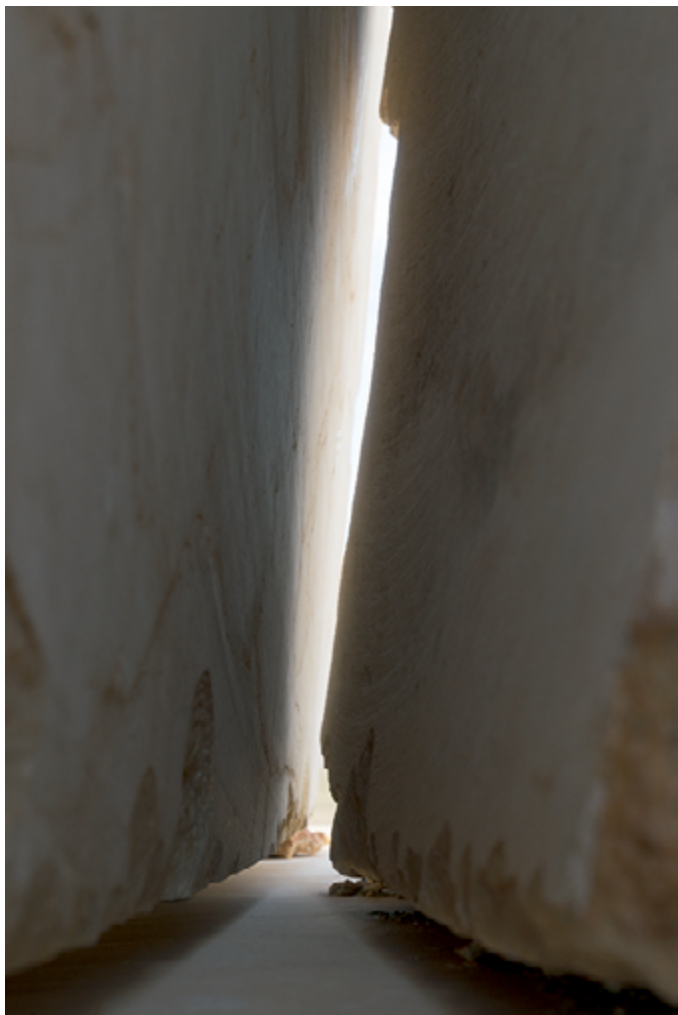
Brecha #01 , 2024. Courtesy of Galería Alarcón Criado

tensions contained within them, thereby eschewing the modern conception of the landscape as a merely natural thing that is foreign to us.