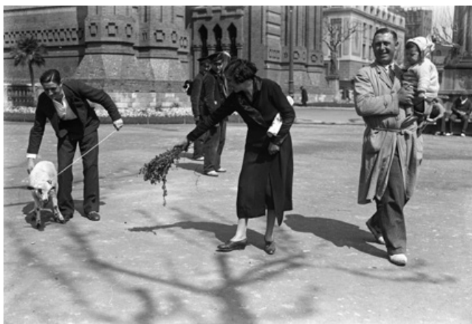
Lamb Resisting. FERIA del Cordero at Passeig Sant Joan in Barcelona on Easter Holiday, April 1934.