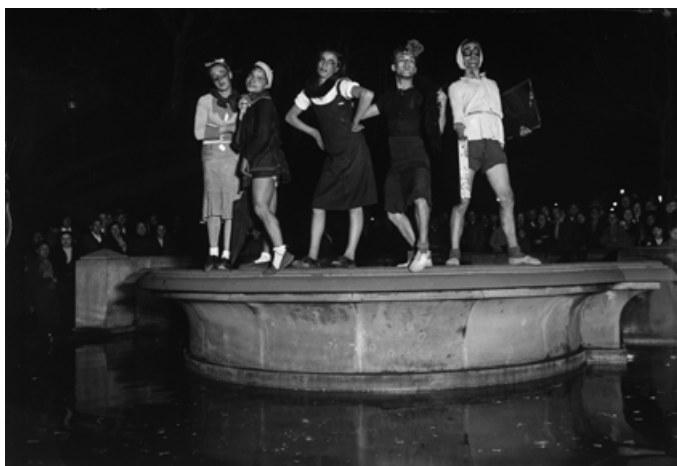
Men Dressed as Women at the Carnival Burial in the Jardines de Salvador Espriu in Barcelona, 1935.