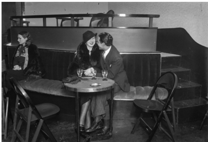
A Couple in a Bar in Barcelona, 1931 - 1936.