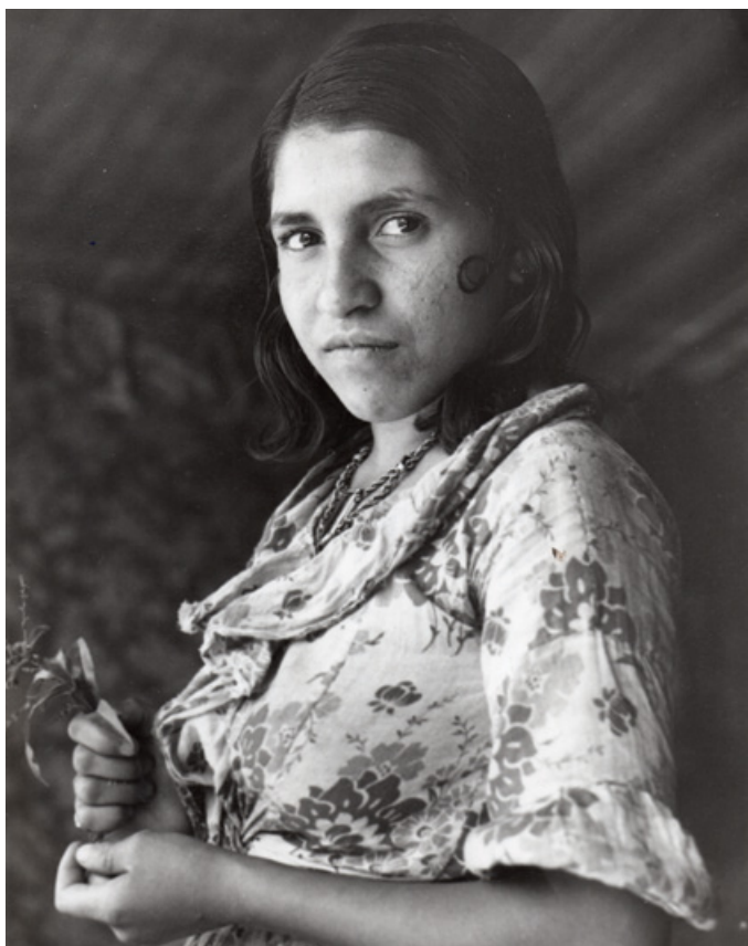
Portrait of a Polish Girl, La Vanguardia , June 9, 1935.