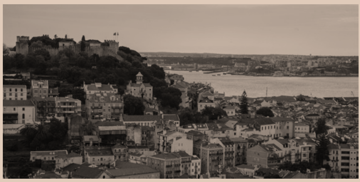
Lisbon, a view of the city featuring Castle of São Jorge