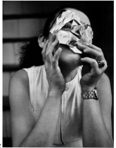
9. The Pale Lady , Barcelona, 1959 / 10. Sun and shade , 1963 / 11. Madrid , 1963 / 12. Palma de Mallorca , 1959

Among the first participants in the debate on photography teaching in Sweden, from 1962 to 1972 he was director of Fotoskolan, the photography school in Stockholm, where some of Scandinavia's most important photographers trained.