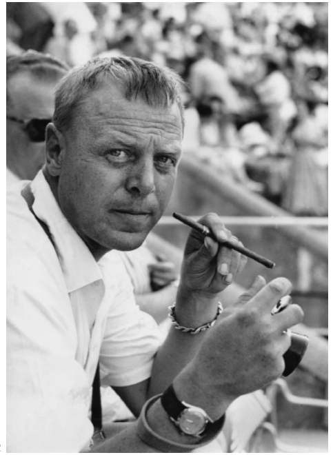
1. Self-portrait, Camargue, c. 1950 / 2. Francis, Christer Strömholm in Spain, c. 1959

According to his own account, Christer Strömholm (Stockholm, 1918-2002) was a boy with excessively combed hair, dressed in a sailor suit and trapped in a bourgeois milieu. His adolescence was a difficult one and a tragic event that took place when he was sixteen - his father's suicide - marked his life forever. Having turned seventeen, Strömholm began to travel the world, embarked on his artistic training in Dresden and attended various painting academies in Paris and Stockholm.