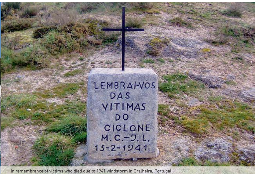
In remembrance of victims who died due to 1941 windstorm in Gralheira, Portugal

tugal since 1755. In comparison with Windstorm Klaus on January 24th 2009, windspeeds along the northern coast of Spain were similar (130-150 kph) to those observed in 1941, but the 1941 storm caused comparable windspeeds over the interior of both Spain and Por-