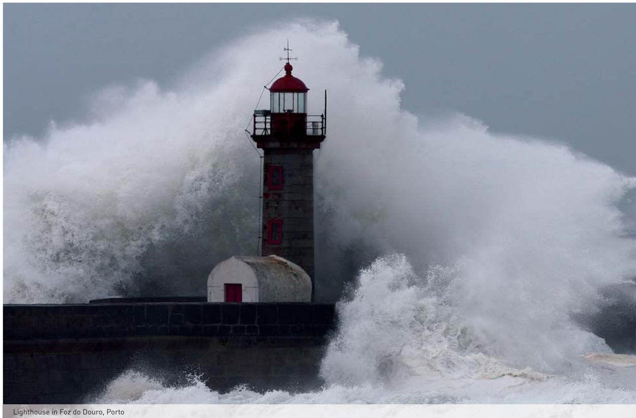
Lighthouse in Foz do Douro, Porto

What happens when the major 'Icelandic' low pressure system is located far to the south?