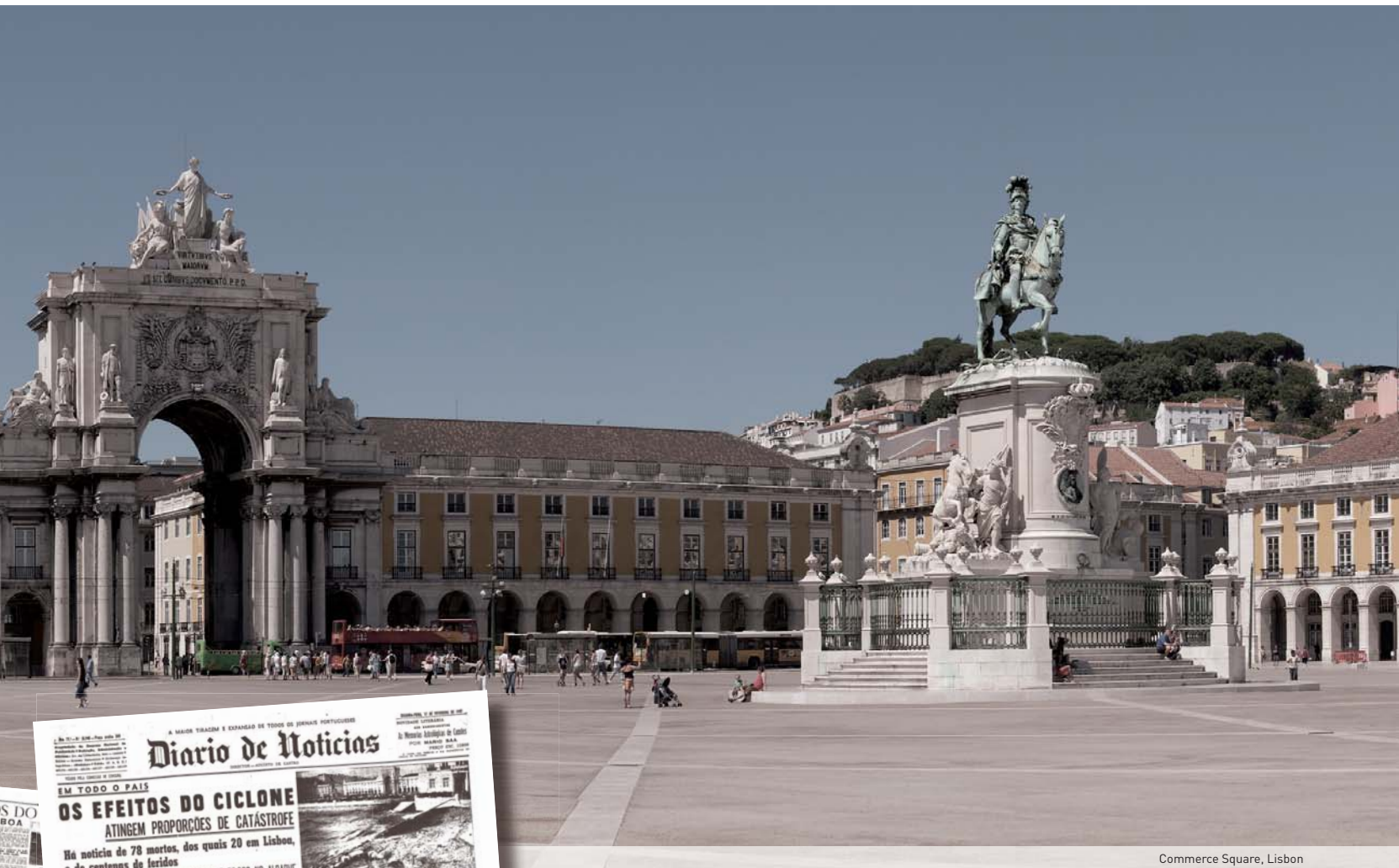
Commerce Square, Lisbon