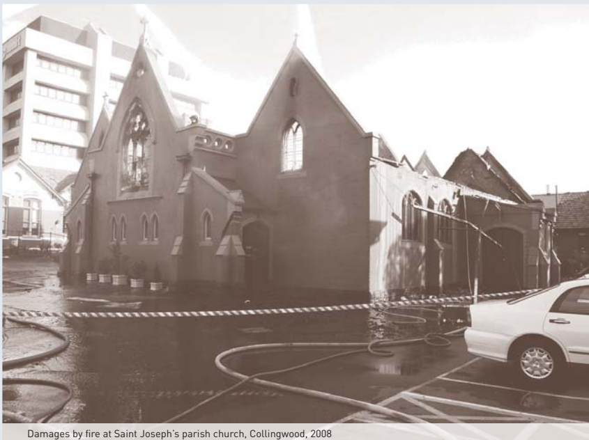
Damages by fire at Saint Joseph's parish church, Collingwood, 2008