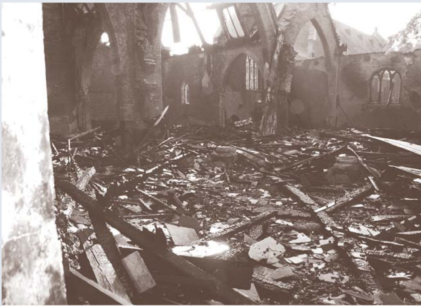
Damages by fire at Saint Joseph's parish church, Collingwood, 2008