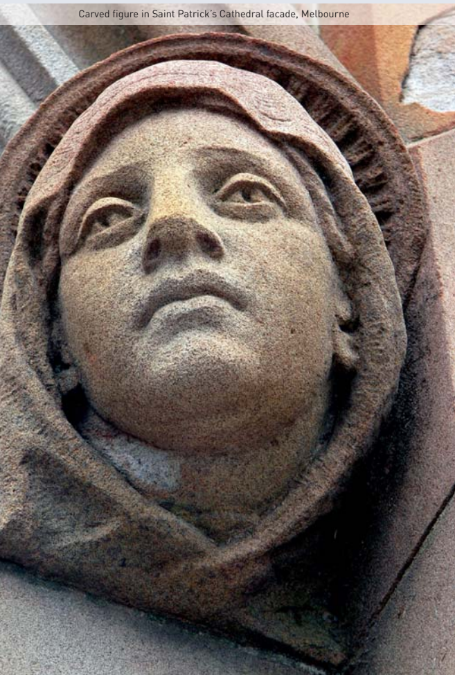
Carved figure in Saint Patrick's Cathedral facade, Melbourne