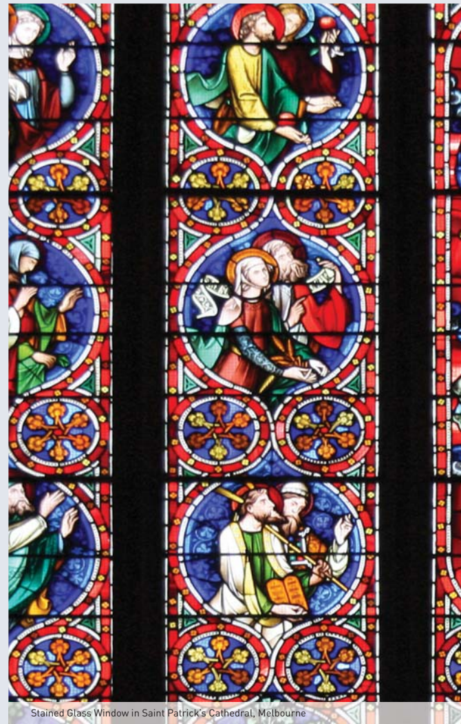
Stained Glass Window in Saint Patrick's Cathedral, Melbourne

The main causes of fire loss are burning candles left unattended, electrical malfunction of equipment and arson