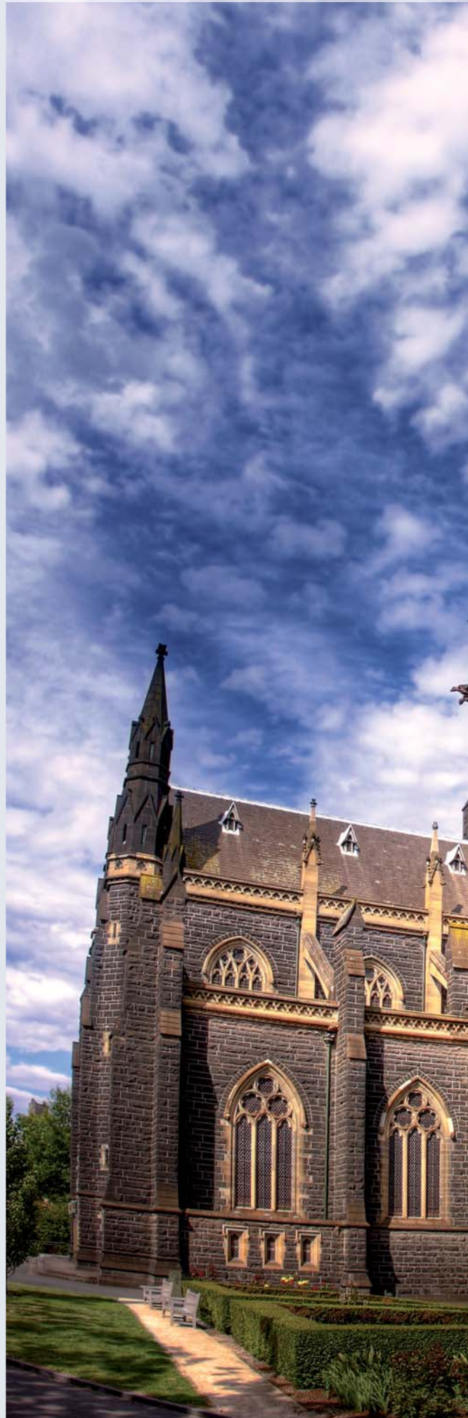
Saint Patrick's Cathedral, Melbourne

We are not aware of any international forum and we do not participate in any such gathering. However, occasionally we do visit similar Church insurers in other parts of the world to discuss matters of common interest and that close association has enabled us to compare their portfolios with our own and to receive information of matters of similar interest, especially large loss events and risk management issues. The Vatican does not offer assistance in this area on a world-wide basis. Generally, each diocese and religious congregation is independent and therefore conducts its own affairs in matters such as insurance. Occasionally, we do seek the guidance of our reinsurers to assist us with risk management advice, which is based on their