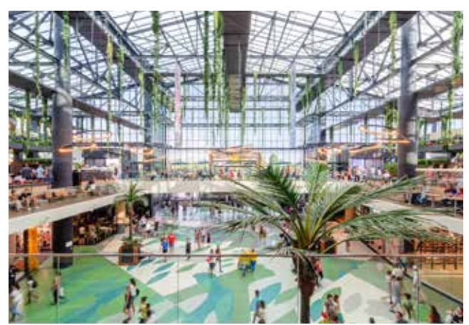
ParkLake Shopping Centre in Bucharest, Romania

Our capital will target mainly minority positions in core assets and will place more emphasis on new development projects. This means that we will continue to decrease our ownership in the existing portfolio, while securing service contracts, to fund new development projects in Europe and emerging markets thereby creating new opportunities to provide services.