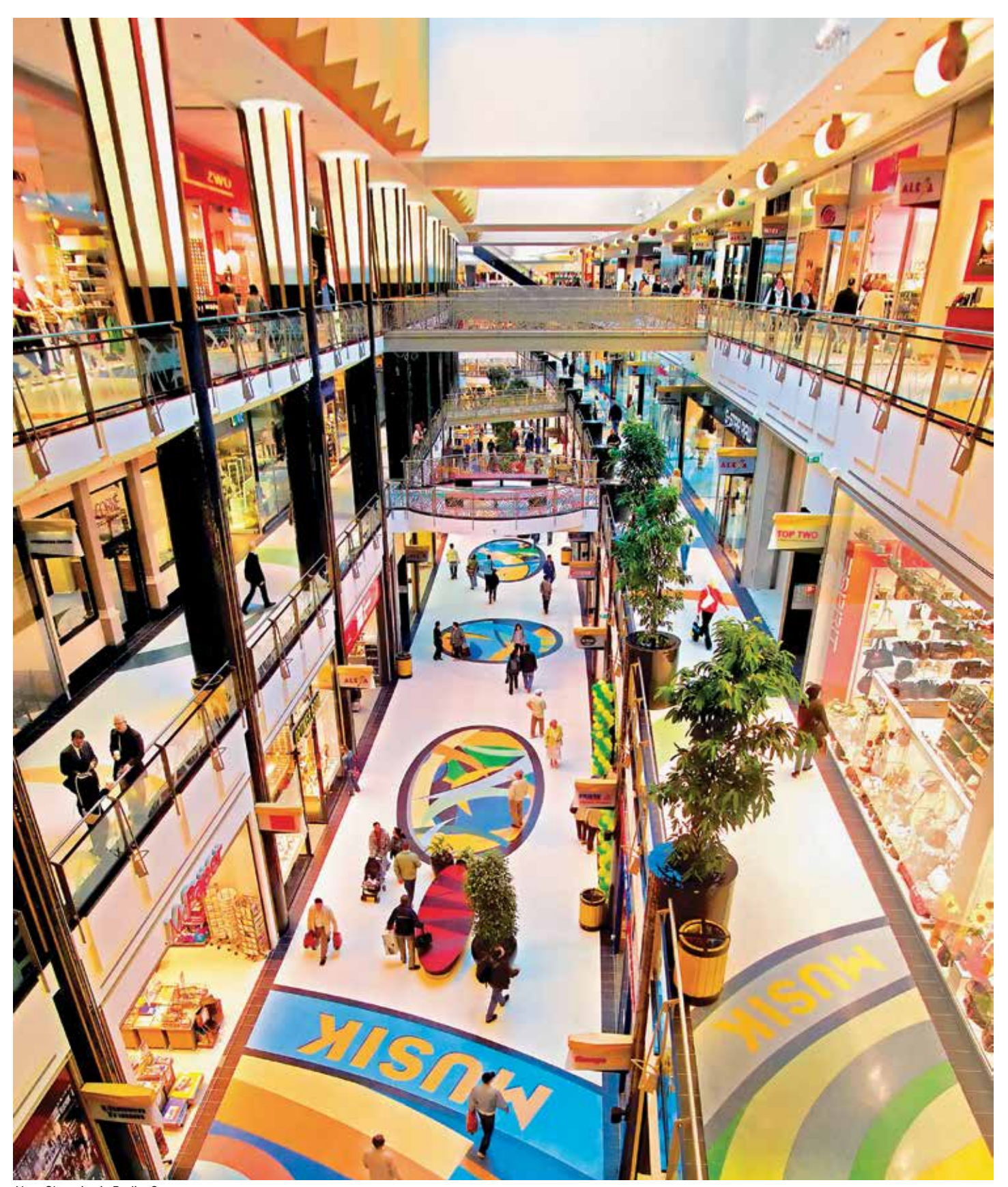
Alexa Shopping in Berlin, Germany