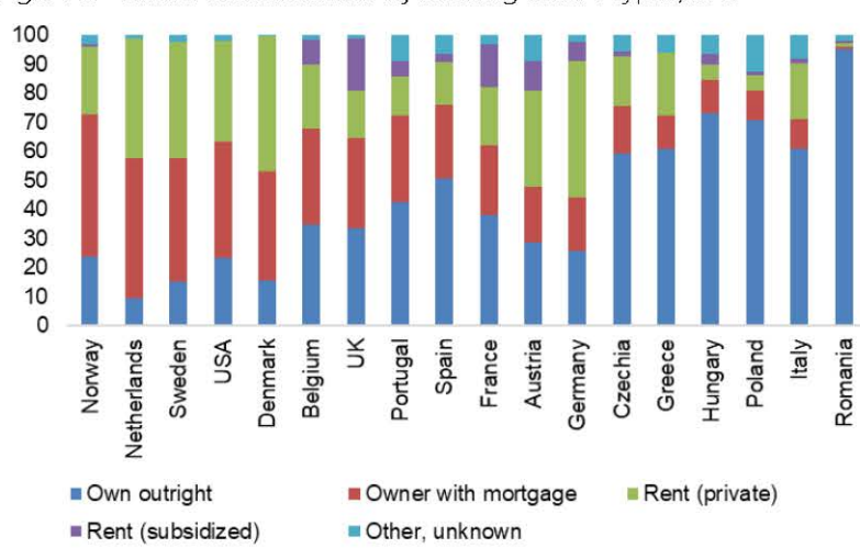
Figure 2 – Share of households by housing tenure types, in %

As long as there is no effective vaccine against Covid-19, countries remain vulnerable to new outbreaks of the pandemic, which would lead to repeated lockdown and restart phases. The obvious reaction of households will be to hike up savings, notably in those countries with high levels of household debt and rising unemployment (Nordic countries, Netherlands, the UK, and to a lower extent France, Belgium, Spain and Portugal, see Figure 2).