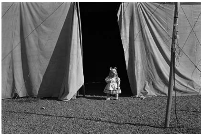
Miss Piggy I, Santiago, from the series The circus, 1984

According to statistics from the National Institute for Human Rights in Chile, victims of the Pinochet regime exceeded 40,000 people, between those murdered, tortured and disappeared.