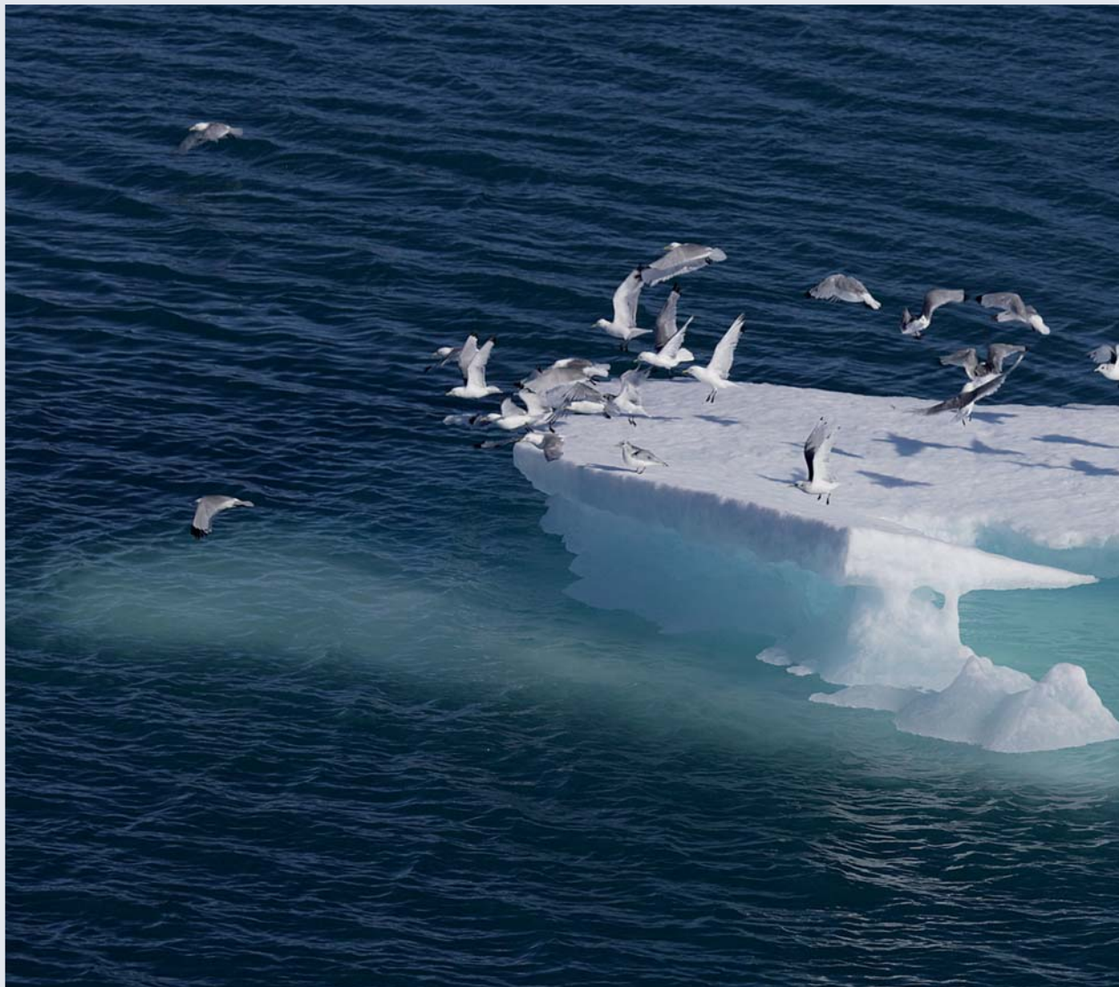
Marine birds on an ice floe at the Nunavut archipelago. Canada

The figure of the white hunter no longer exists and today's hunters are almost butchers