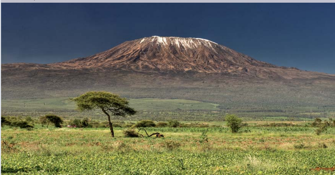
Mount Kilimanjaro. Tanzania

working as a journalist, I had the opportunity on three occasions to come here but each time I was unable to. So this is something I have always wanted to do. I do not want to die without having lived in what is, for now, the capital of the western or first world. I might