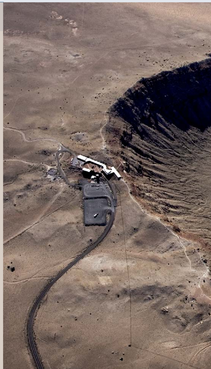
Barringer crater in Arizona. USA

In Don Quixote , "we intend to launch two probes, one to observe the asteroid, its mutation, what the surface is like and its field of gravity; and a second probe which will reach a high speed and crash into it, moving it with the impact. We presented this idea in a European open tender, which we were awarded against all predictions and hence, it has become the ESA mission to fight against the asteroids".