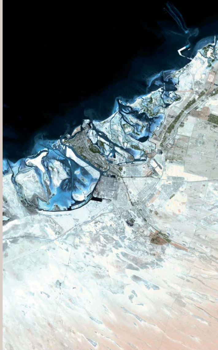
United Arab Emirates

A new satellite is scheduled to be launched in 2013: Deimos 2, with higher resolution (400 times more), greater output and size than its predecessor. It is a very important "leap" for Belló, "nobody before had put a metre of resolution into 300 kilos and we think that it is feasible and that it will work well". In addition, there is another revealing aspect: the satellite has been integrated within their installations in Puertollano, "taking a new step in the value chain for the Earth's observation".