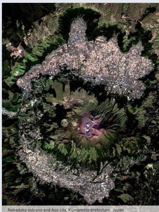
Nakadake volcano and Aso city, Kumamoto prefecture. Japan

Elecnor Deimos has set itself the goal of continuous and sustained growth and becoming a large multinational corporation