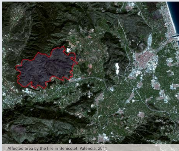
Affected area by the fire in Benicolet, Valencia, 2011