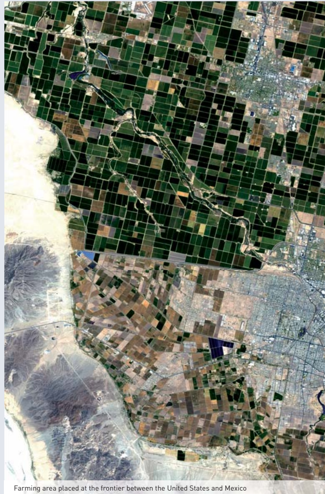
Farming area placed at the frontier between the United States and Mexico

For Elecnor Deimos, the insurance sector is a fundamental client “with which we have been cooperating for several years and we are sure that this cooperation will be even greater in the future. The Earth observation sector is emerging and will be increasingly applicable in insurance. The relationship between technology and insurance is very close”.