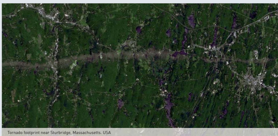
Tornado footprint near Sturbridge, Massachusetts, USA

although there are other companies and universities, in the Consortium. As experts in planetary landings, in Elecnor Deimos, we are working hard on methods for landing on the moon or on planets such as Mars. We are going to carry out tests on Earth, with an unmanned aerial vehicle, the algorithms that detect the planetary surface, whether there are risks and what decision to take. It is a question of simulating a planetary landing on a perfect platform, developing GNC algorithms, which is an important system since it is the brain of satellites or launchers. In short, PERIGEO is a project to develop advanced GNC techniques where Spain has an important technological niche.