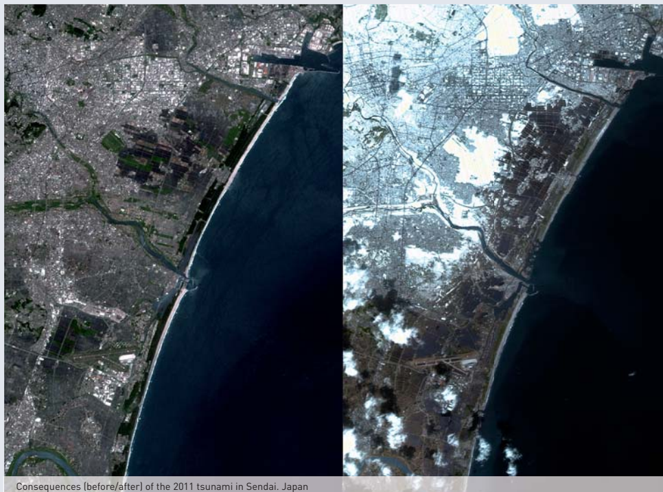
Consequences (before/after) of the 2011 tsunami in Sendai, Japan