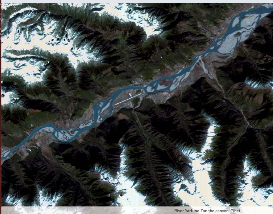
River Yarlung Zangbo canyon. Tibet

General Manager of Elecnor Deimos Madrid - Spain