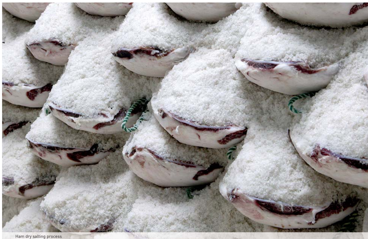
Ham dry salting process

This last part of the drying stage takes place in summer-like conditions, with the hams kept at temperatures in the region of 25°C for about three months.