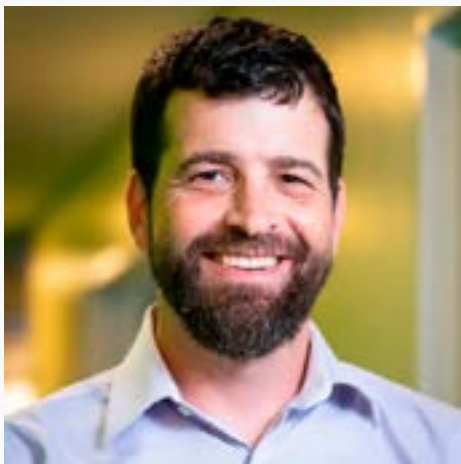
SAM MADDEN HEAD OF COMPUTER SCIENCE, EECS DEPARTMENT AT MIT

From 1997–2015, CHC spearheaded a national media campaign in collaboration with MENTOR: National Mentoring Partnership to recruit volunteer mentors for young people from underprivileged circumstances. The annual number of young people matched with volunteer mentors through local programs grew from 300,000 in 1997 to over 3.5 million a decade later.