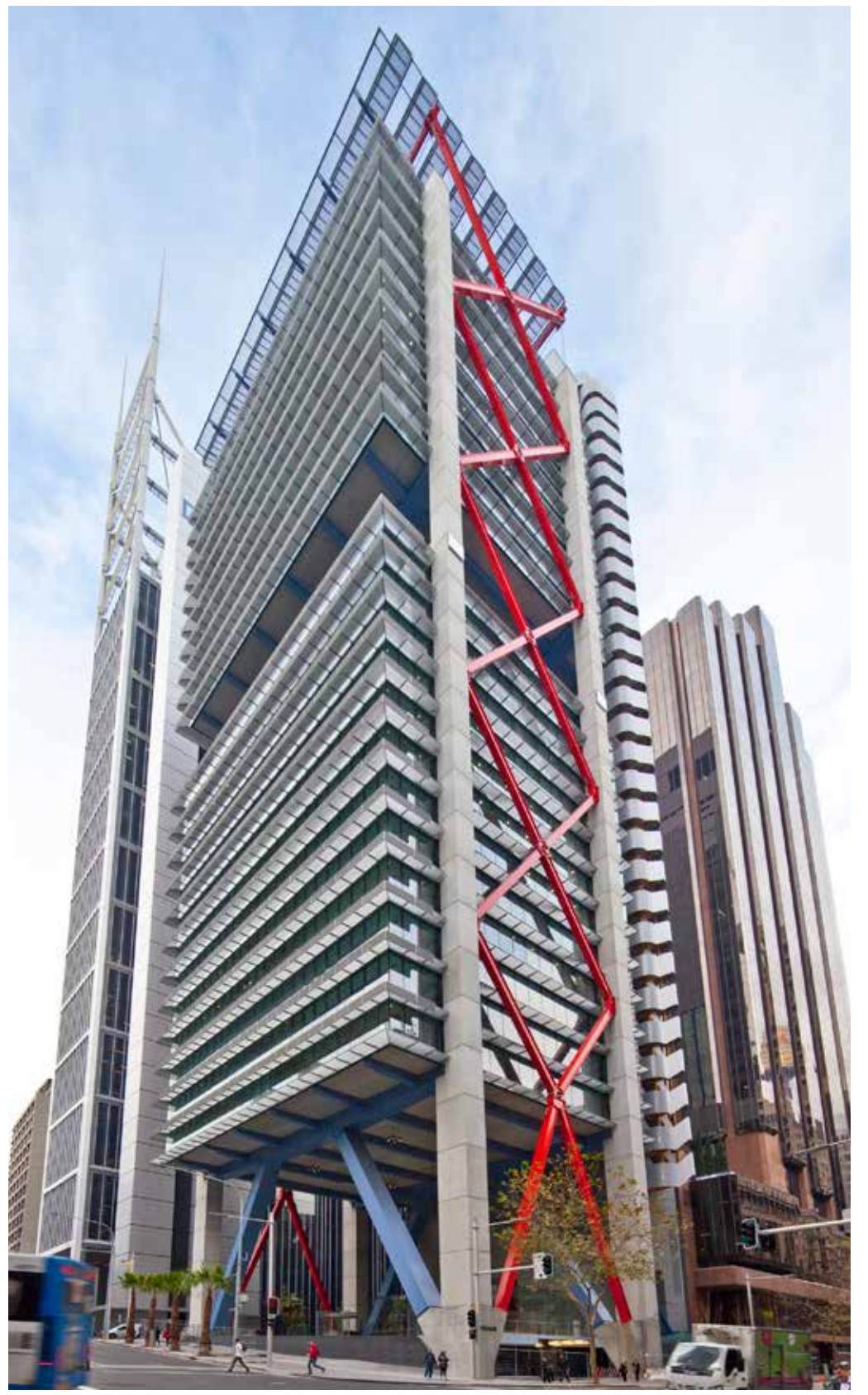
QBE's Group Head Office, in Sidney, Australia.

Acclaim and QBE Singapore have a relationship that goes back decades. However, in recent years, we have seen QBE responding to our Acclaim team in proactive ways, serving the needs of our clients in Singapore and the Asian region. They are prepared to break the boundaries to craft creative risk solutions, responding to the challenging needs of our corporate clients.