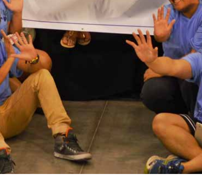
QBE employees participate in a local school refurbishment programme in Manila, Philippines.