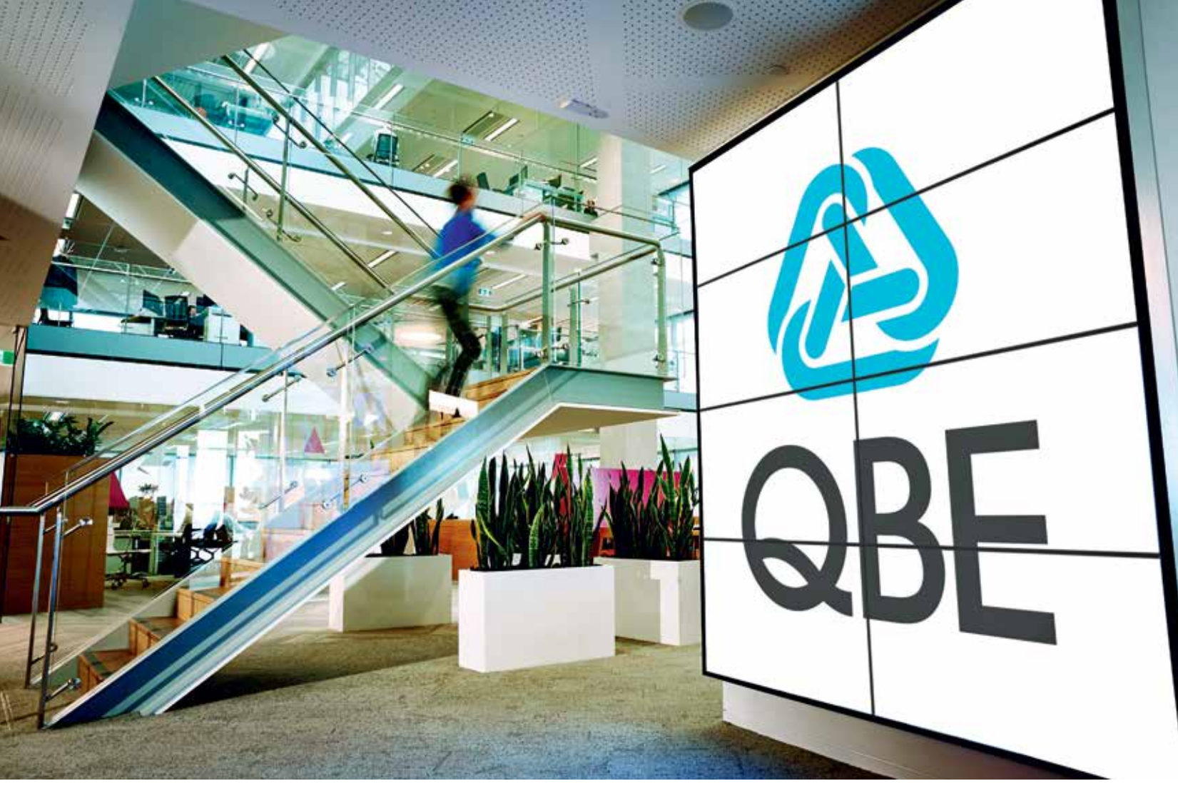
QBE's Group Head Office, in Sidney, Australia.

For Latin America as a whole, the economic and the political environments show signs of improvement in a couple of key markets, with the average GDP growth expecting to rebound to around 2% next year. Our strategy is on the lines of business where we see the highest potential for profitable growth, where there is the closest connection to QBE's core capabilities and where the best opportunities for building the strongest partnerships with intermediaries including brokers and with policy holders in general.